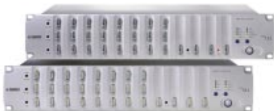
AA-26+2 - Analog MADI Snake