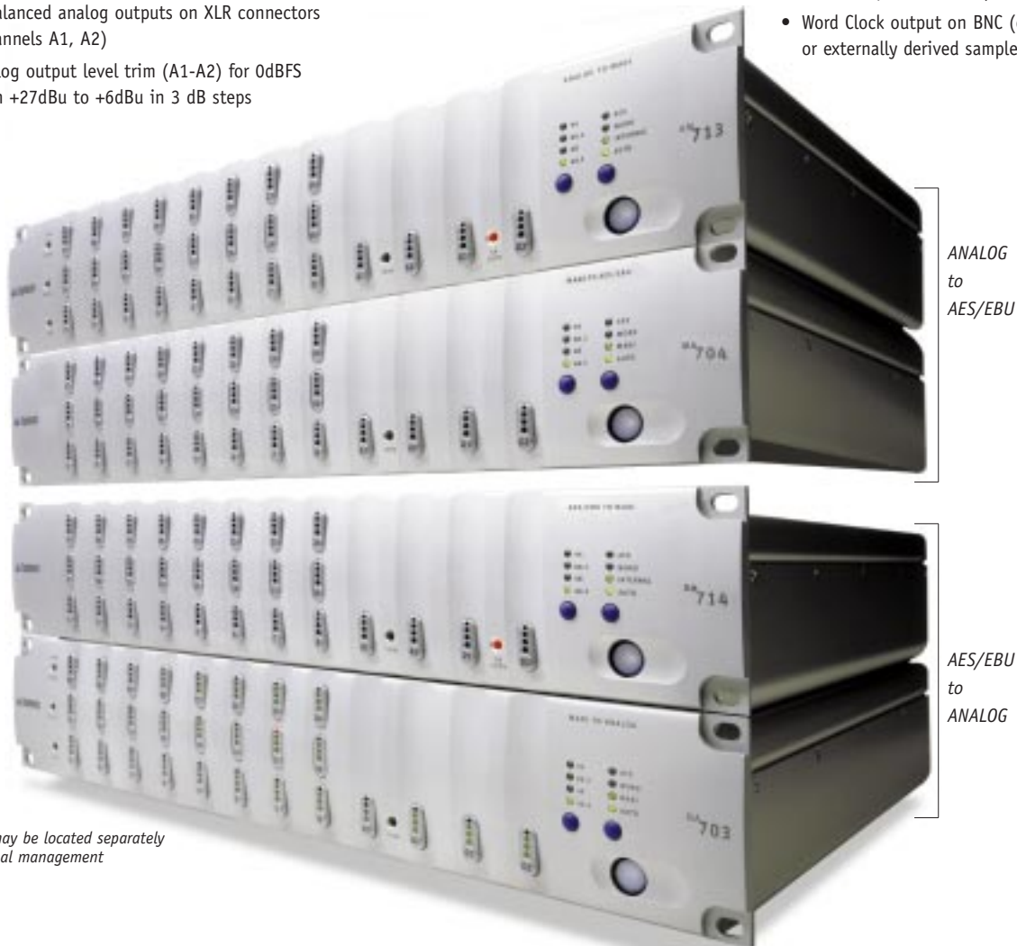
converter units may be located separately for optimum signal management