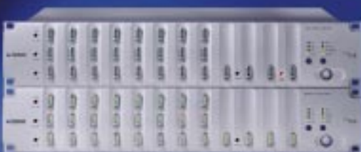
AES/EBU Digital to Digital Converters