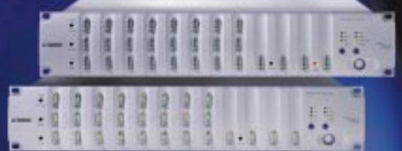
ANALOG MADI SNAKE