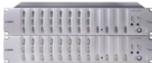
DD-26+2 AES/EBU - Digital to Digital Converter