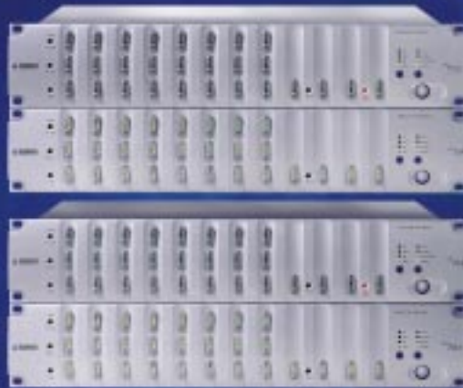
AES/EBU to ANALOG