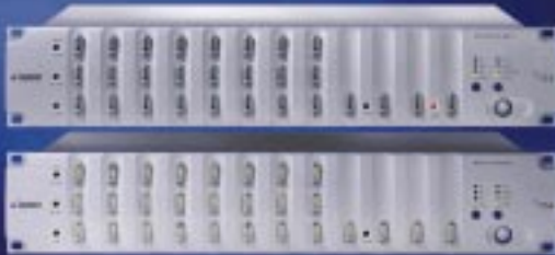
AES/EBU to MADI