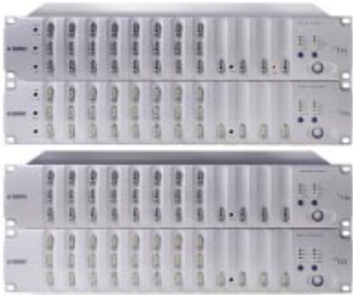
DA-26+2 - AES/EBU to Analog

Euphonix, manufacturer of high performance audio systems, presents a full line of Multi-Channel Audio Converters for Broadcast, Music and Post Production applications. These new products provide audio professionals with breakthrough solutions by reducing the cost and complexity of converting multi-channel audio signals between the various analog and digital formats.